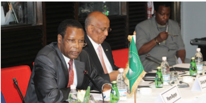
President Pierre Buyoya, AU High Representative for Mali and the Sahel (left), and Mr Dileita Mohamed Dileita, former member of the AU High Level Panel on Egypt (right), share their mediation experiences.

In January 2012, a number of insurgent groups waged a violent independence campaign for the Azawad region in northern Mali, against the government in Bamako. Spearheaded by the Tuareg-led Mouvement National pour la liberation de l’Azawad (National Movement for the Independence of Azawad (MNLA)), insurgent groups wrested Azawad from the government by April of that year. The influx of light and heavy weaponry into the region following the 2011 military intervention in Libya is also attributed as having contributed to the arming of Tuareg fighters in northern Mali, which had a considerably damaging effect on the country’s overall security and stability. Compounding the crisis was the ousting of President Amadou Toumani Touré in a coup d’état just a month before presidential elections were scheduled to take place. In the wake of these developments, a mutiny ensued and the constitution of the country was suspended, whilst the MNLA advanced in the north to seize control of three major cities (Bakrania 2013).