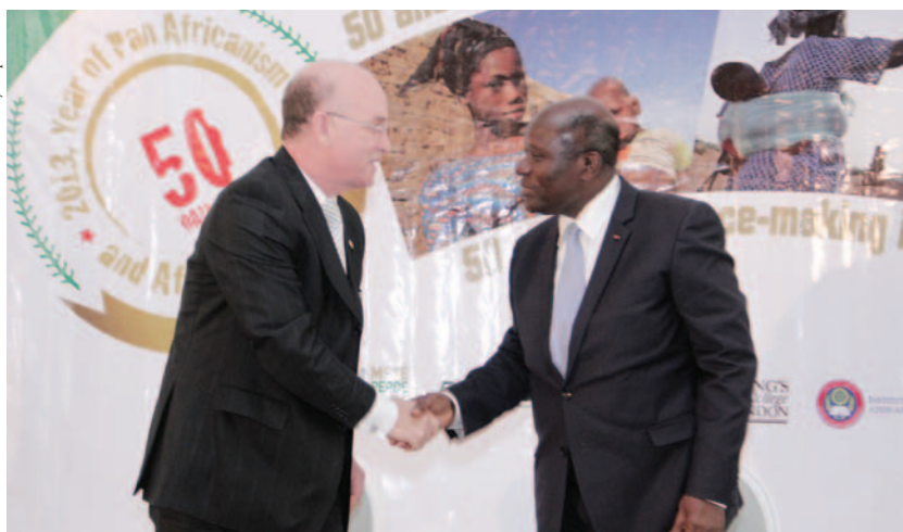
Mr Smail Chergui, AU Commissioner for Peace and Security (left), is greeted by the Prime Minister of Côte d'Ivoire, Mr Daniel Kablan Duncan (right), at the opening ceremony of the Fourth AU High-Level Retreat.