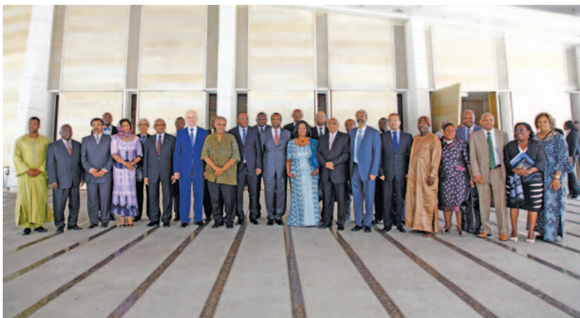
AU Peace and Security Department

The fourth retreat, themed '50 years of peacemaking in Africa: A critical retrospective of OAU/AU peacemaking' was held in Abidjan, Côte d'Ivoire, on 29 and 30 October 2013. This retreat had as its main objective reviewing 50 years of mediation experience in Africa, while analysing and recommending ways to support collaborative and preventive conflict resolution efforts. This report is based on the proceedings of this retreat and captures the content, insights and experiences generated through discussions and debates that occurred during the two days.