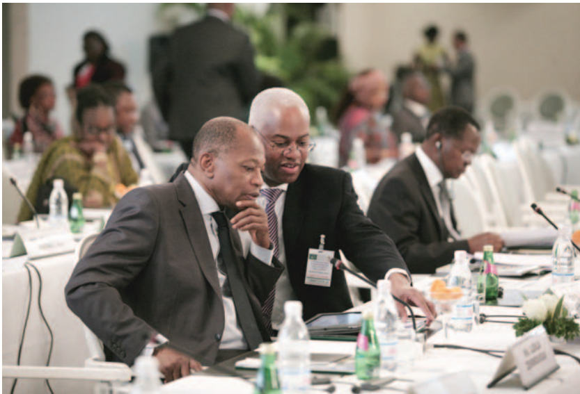
AU Peace and Security Department

Ultimately, the reflective space provided by the AU high-level retreats has and will continue to bolster steady movement towards a well thought-out policy-backed mediation strategy which, when well-resourced, financed and implemented, will lead to the achievement of an Africa that is free of wars by 2020.