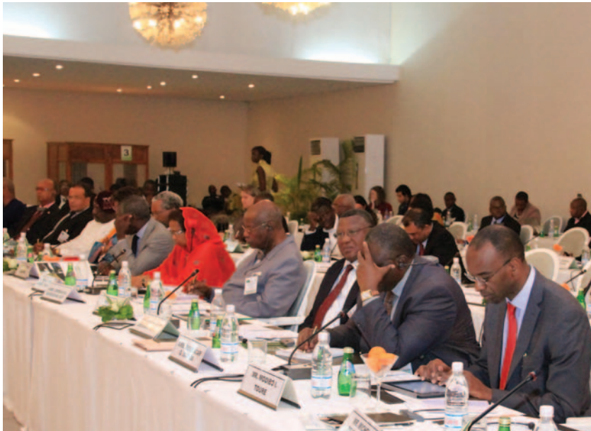
AU Peace and Security Department

The AU's PCRD framework was developed at the 7 th Ordinary Session of the Executive Council in Libya in July 2005 to drive the organisation's responsibility to rebuild. It is envisioned that the policy will establish conflict management mechanisms and reliable institutions based on democratic principles and that it will strengthen institutions so they are more capable of addressing conflicts to avoid their resurgence. Moreover, the APF was established to ensure that ample resources are available to drive APSA initiatives. Within the framework of the APSA, the role of the AUC cannot be understated. Given the fact that the commission serves as the secretariat of the AU, and that it provides the necessary links between the chairperson, the assembly and the PSC, the AUC can arguably be called the prime implementing agent in many peace and security processes (Williams 2011).