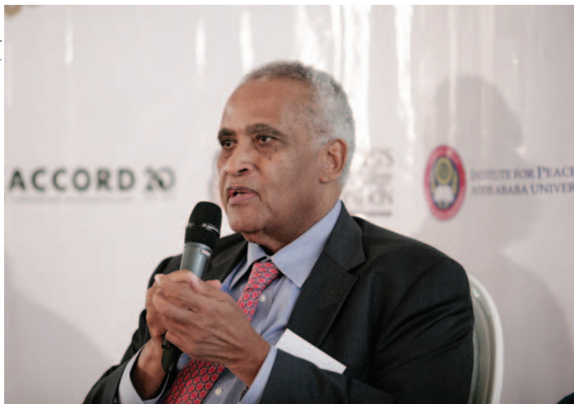
Former Secretary-General of the OAU (1989–2001) Dr Salim Ahmed Salim speaks on the evolution of OAU/AU conflict management efforts. Dr Salim is now a member of the AU Friends of the Panel of the Wise.

In 1993, in an attempt to improve the OAU's performance, the Central Organ of the OAU Mechanism for Conflict Prevention, Management and Resolution was established to replace the Commission of Mediation. The organ had a broader mandate that led to the creation of the Conflict Management Centre within the OAU Secretariat and the deployment of civilian and military missions, although of small numbers and limited sizes. However, its performance was characterised by difficulties and ineffectiveness and ultimately, it was transformed into the PSD's Conflict Management Division (CMD) following the transformation of the OAU into the AU.