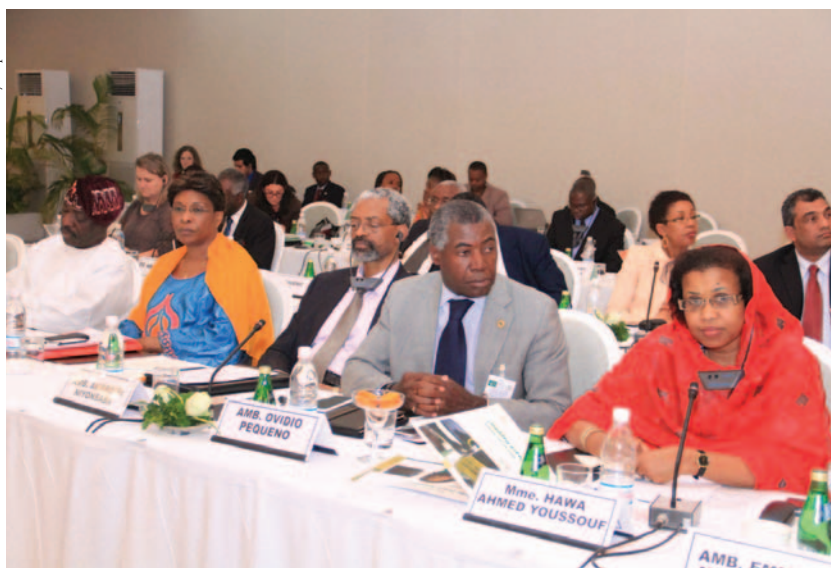
Delegates at the retreat deliberate on the best practices of 50 years of OAU/AU peacemaking.

The key peacemaking institution of the APSA, the AU PW, is specifically mandated to support the efforts of the PSC – and the chairperson of the AUC – in terms of peacemaking and conflict prevention. For members of the panel to achieve the necessary gravitas to be effective mediators, facilitators, negotiators and peacemakers, they are barred from holding active political office whilst serving on the panel. The AU PW is widely regarded as an innovative mechanism that reconciles traditional African peacemaking approaches with contemporary practice of preventive diplomacy and peacemaking in general (African Centre for the Constructive Resolution of Disputes 2013). The Pan-Wise, which involves institutions and individuals engaged in mediation activities, was also established to support and enhance the efficiency of mediation efforts in Africa. The AU has deployed members of the AU PW, special envoys and high-level implementation panels made up of respected African dignitaries to crisis regions. These AU diplomats have been very instrumental in preventing and mediating an end to conflict.